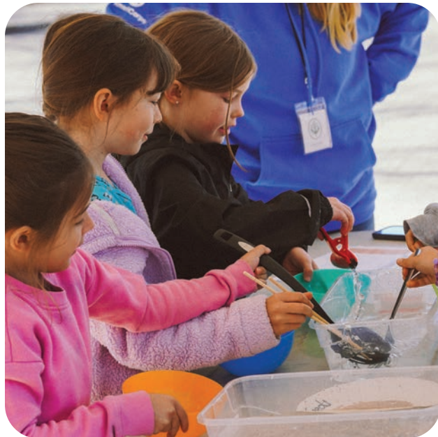
Community Grows Here

In addition to the beautifully developed spaces, Idaho Botanical Garden hosts a series of music, cultural arts, community and family events while offering education programs for all ages year-round.